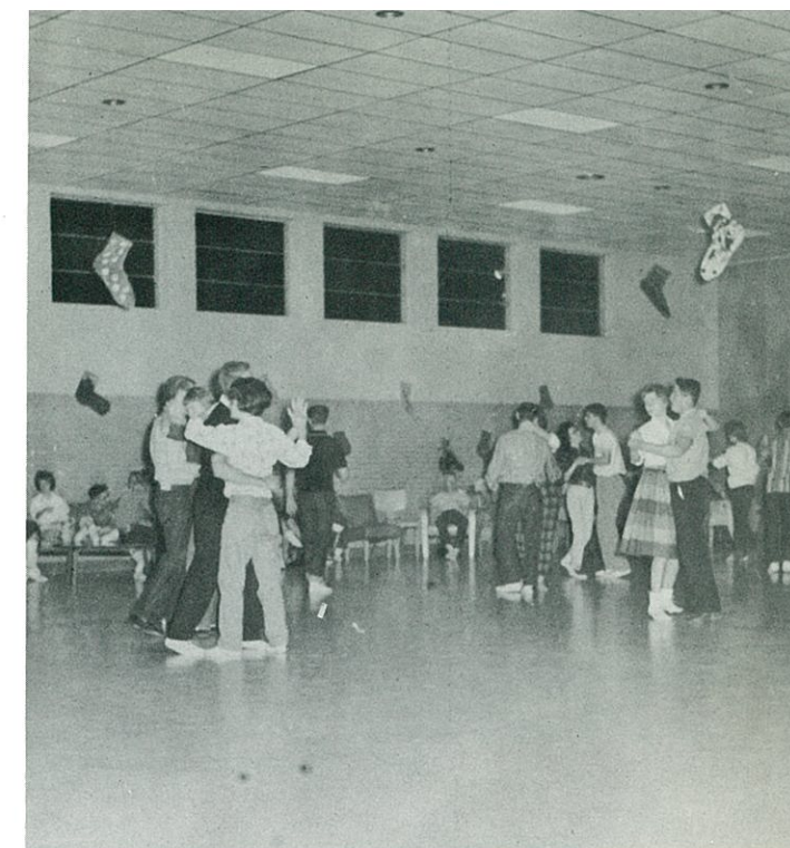
"Dancing In My Socks"