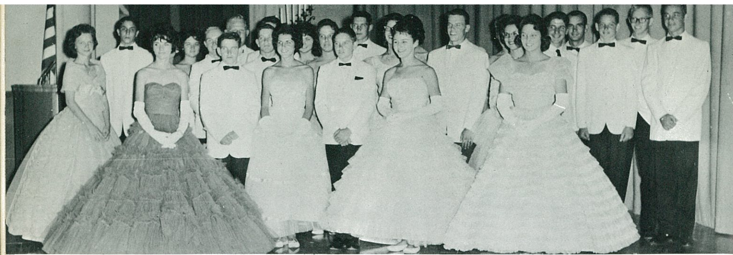
Student Council representatives are shown as they were installed for 1961-62.